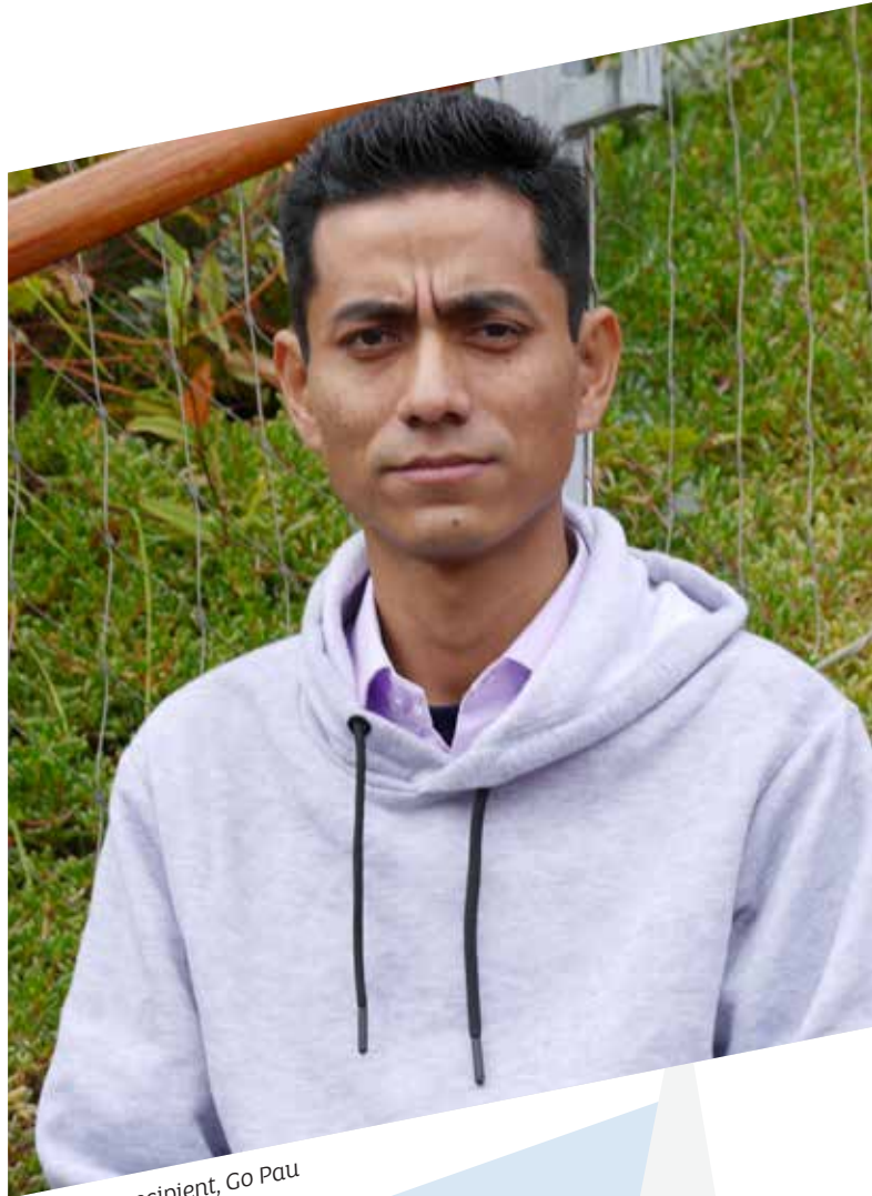
2019 grant recipient, Go Pau