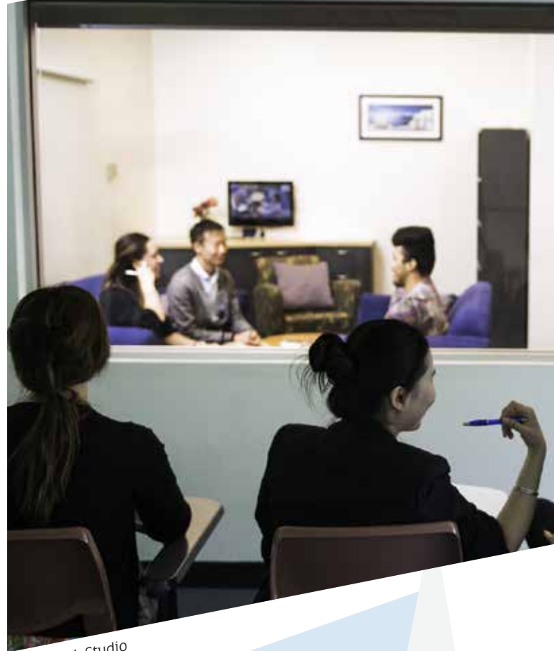
Social Work Studio