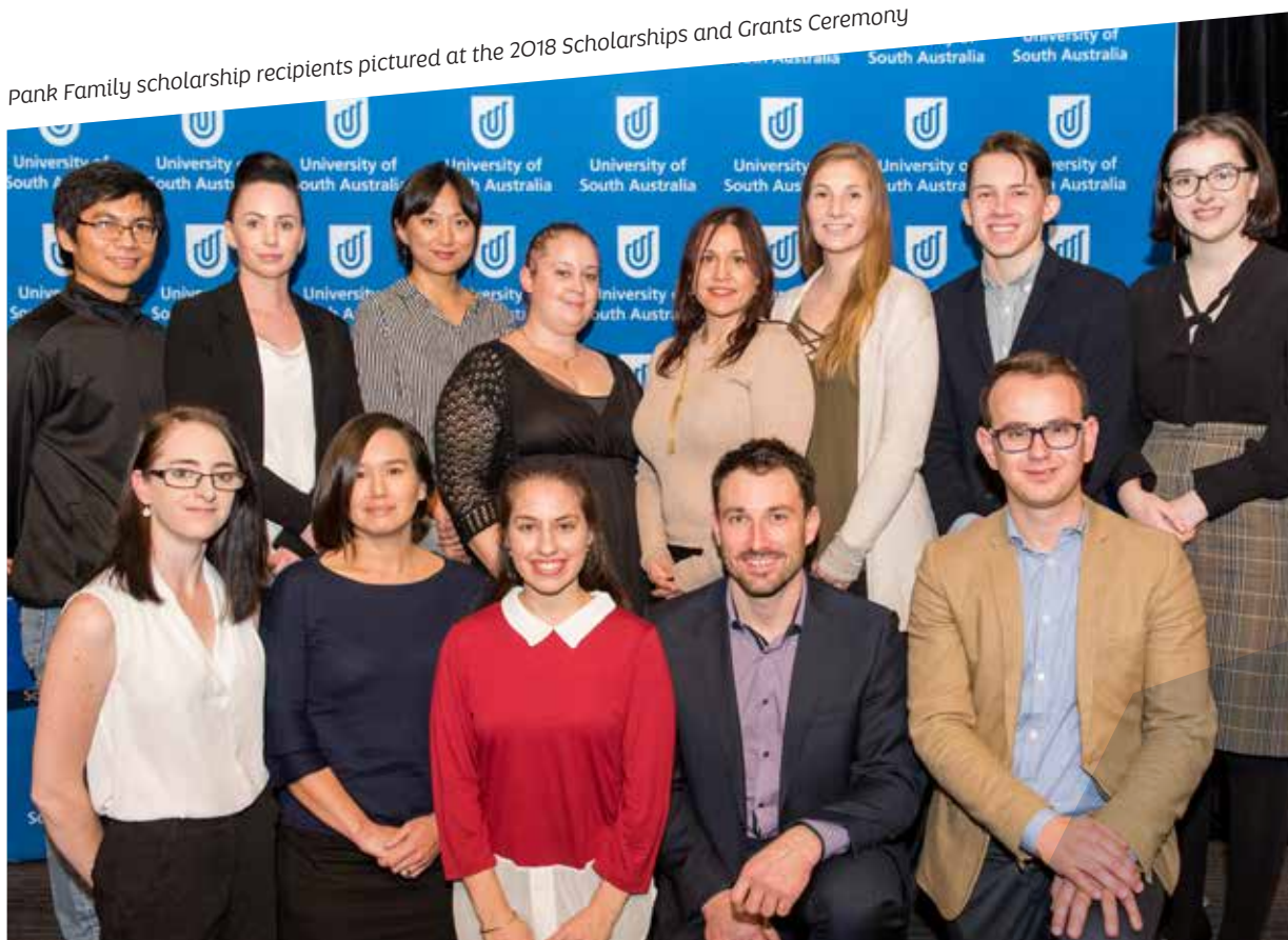
Pank Family scholarship recipients pictured at the 2018 Scholarships and Grants Ceremony